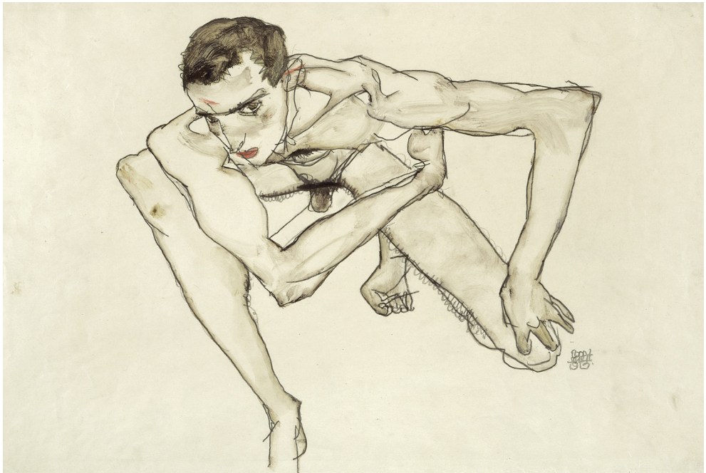
Egon Schiele, Self Portrait in a Crouching Position 1913. Photo: Moderna Museet/Stockholm.